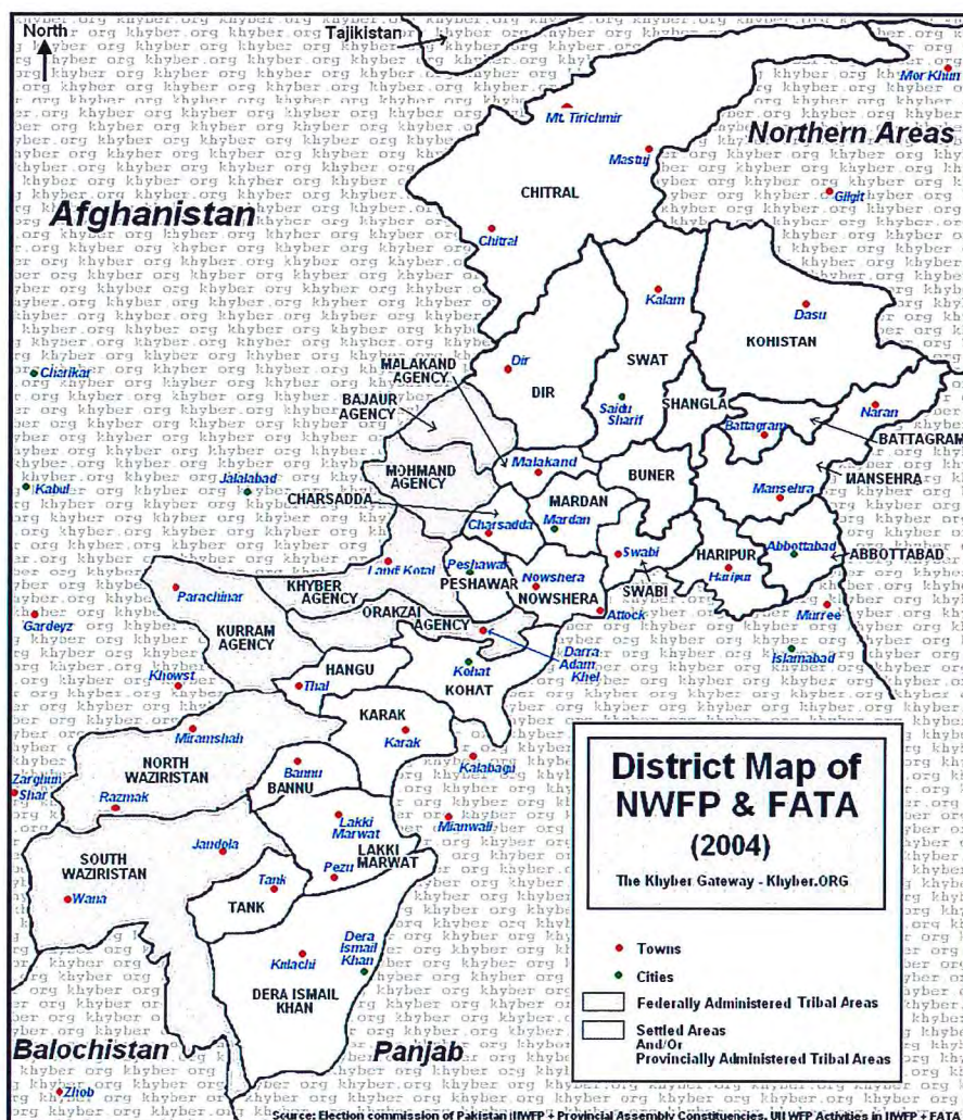
Appendix A Figure 1: Map of FATA

Source: "The Captain's Journal » Taliban and al Qaeda Strategy in Pakistan and Afghanistan." The Captain's Journal » Taliban and al Qaeda Strategy in Pakistan and Afghanistan . N.p., n.d. Web. 4 Mar. 2014. < http://www.captainsjournal.com/2008/03/23/taliban-and-al-qaeda-strategy-in-pakistan-and-afghanistan/ >.